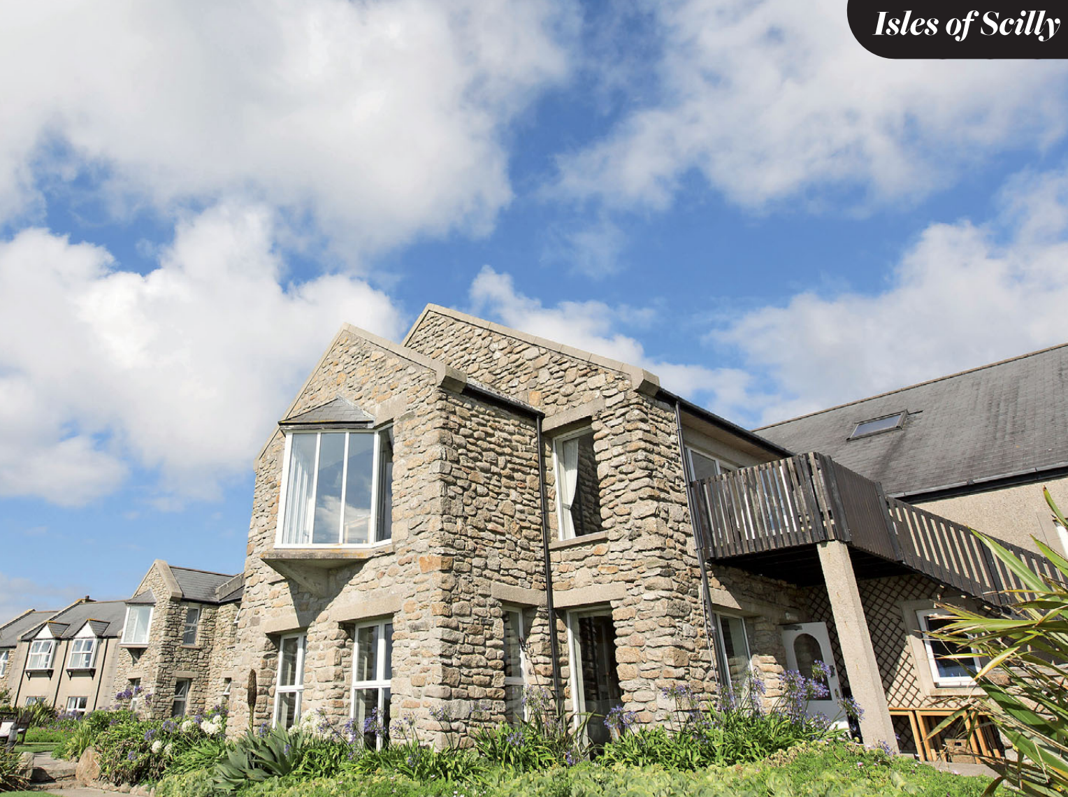
Welcome to Karma St Martin's

stretch of water the separates St Martin's from neighbouring Tresco.