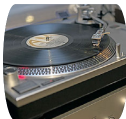
above The hotel has a large collection of vinyl discs

St Martin's isn't very big – but that doesn't mean there's nothing to do. The beautiful white sand beaches are utterly unspoiled and – when we