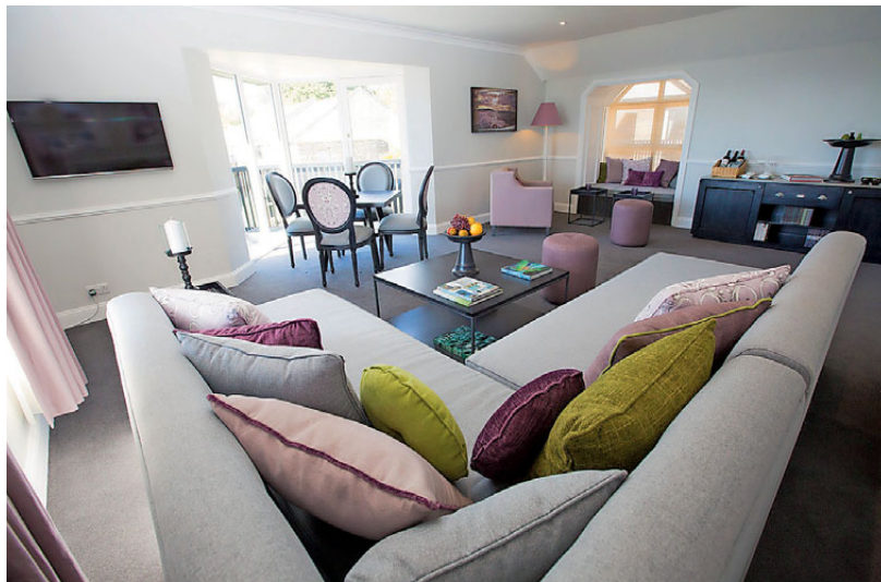
Ready for romance: the honeymoon suite at Karma St Martin's