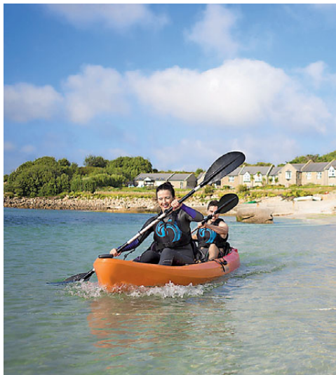
Get out on the water at Karma St Martin's

'The beautiful white sand beaches are utterly unspoiled and – when we were there in September – almost deserted.'