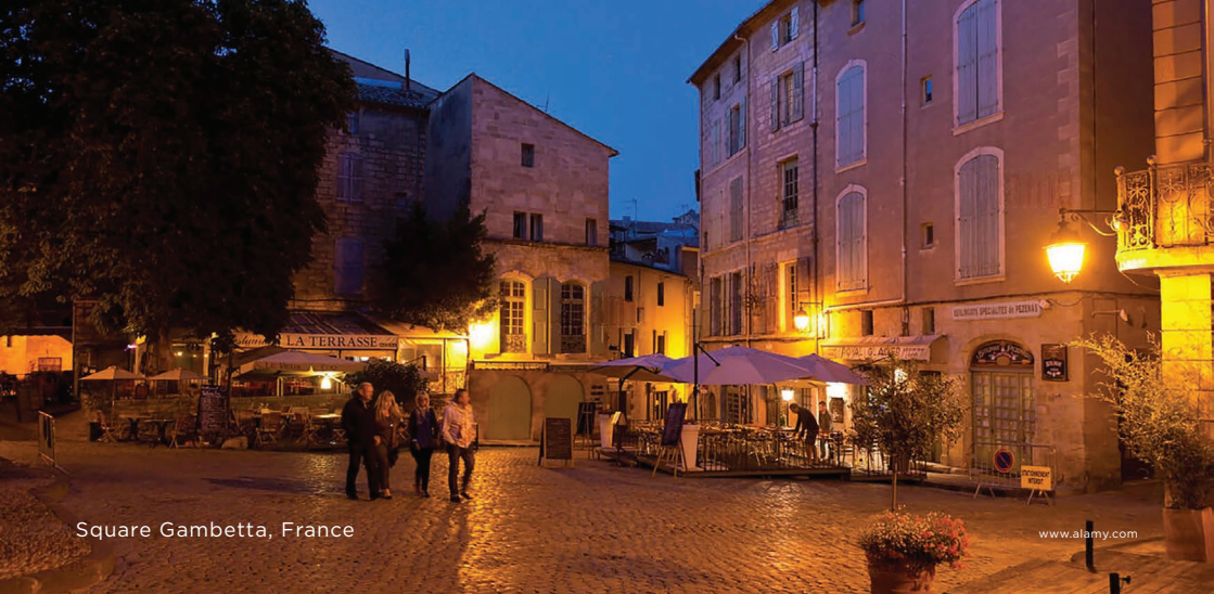
Square Gambetta, France