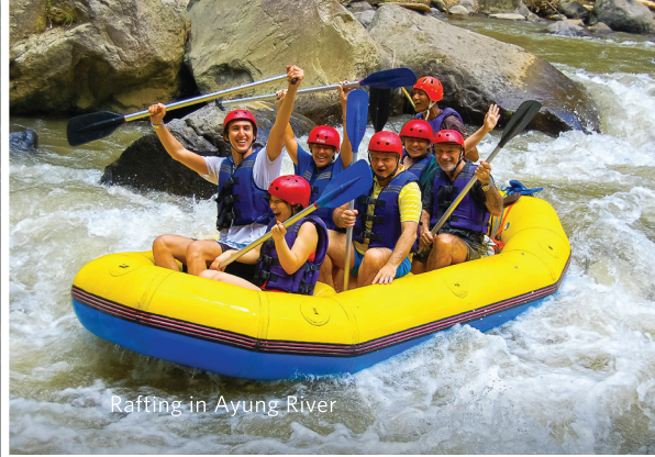
Rafting in Ayung River