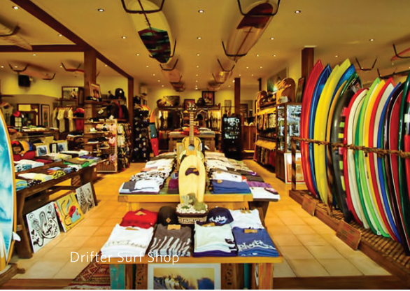
Drifter Surf Shop