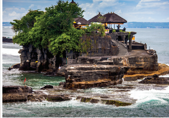
Tanah Lot Temple