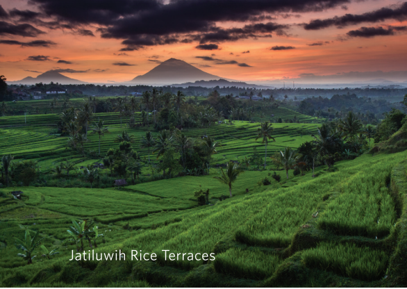
Jatiluwih Rice Terraces