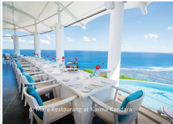
di Mare Restaurant at Karma Kandara