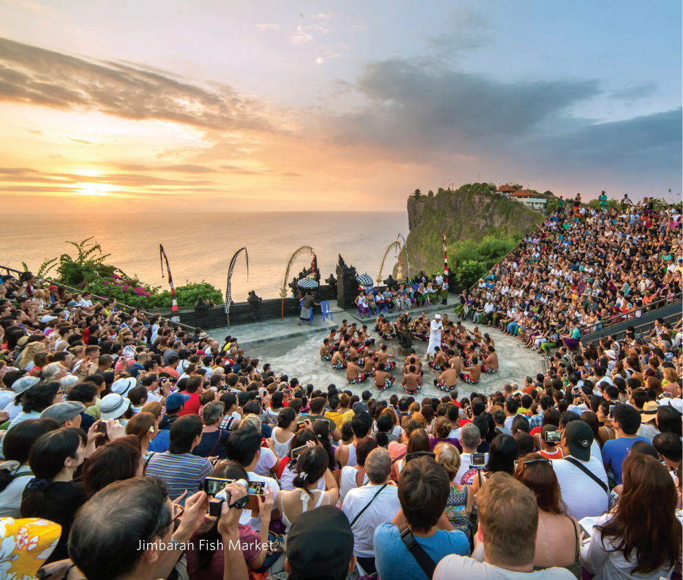
Jimbaran Fish Market