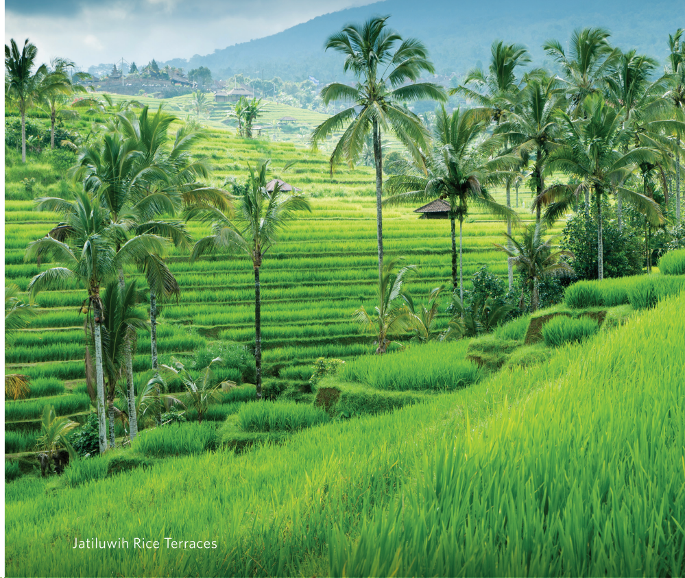
Jatiluwih Rice Terraces