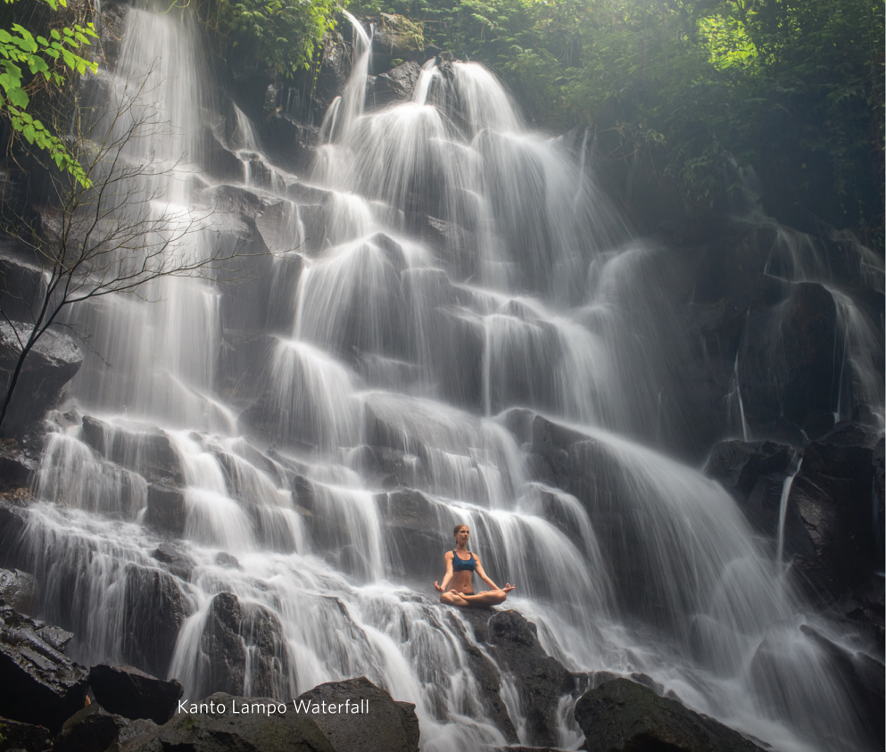
Kanto Lampo Waterfall