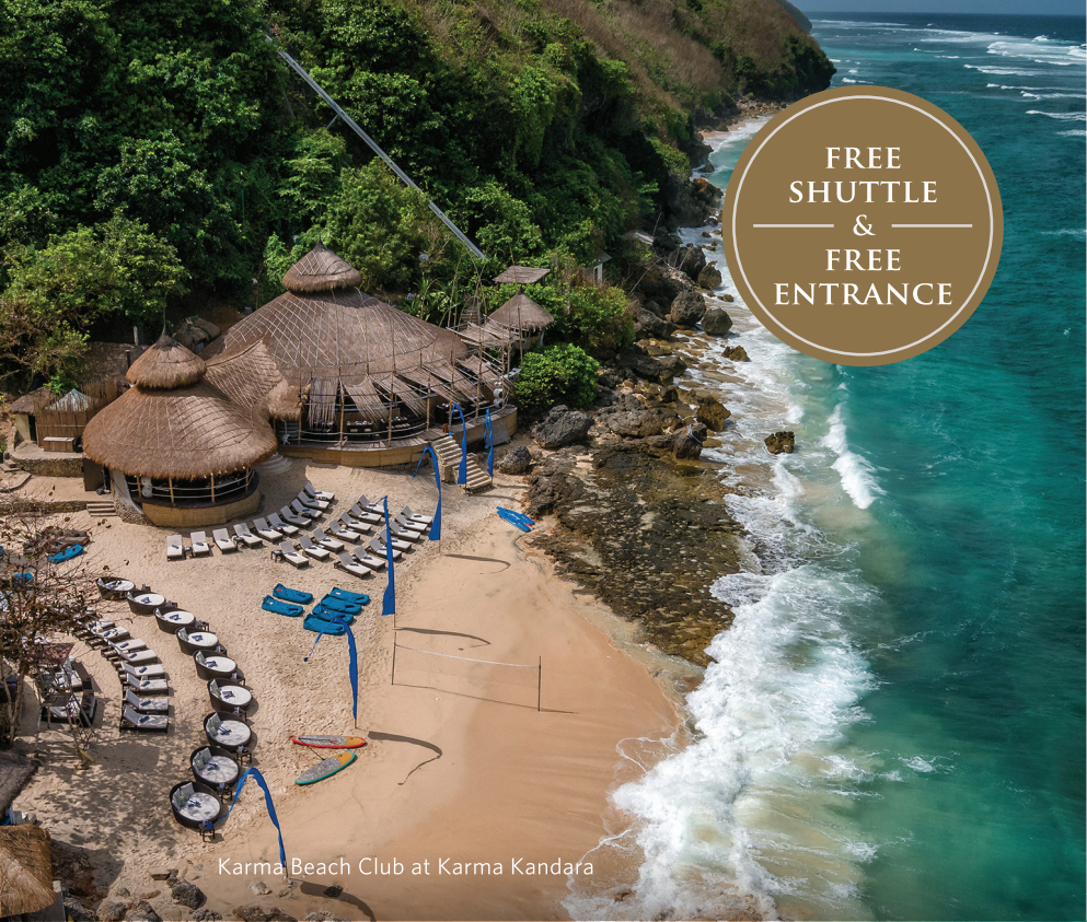
Karma Beach Club at Karma Kandara