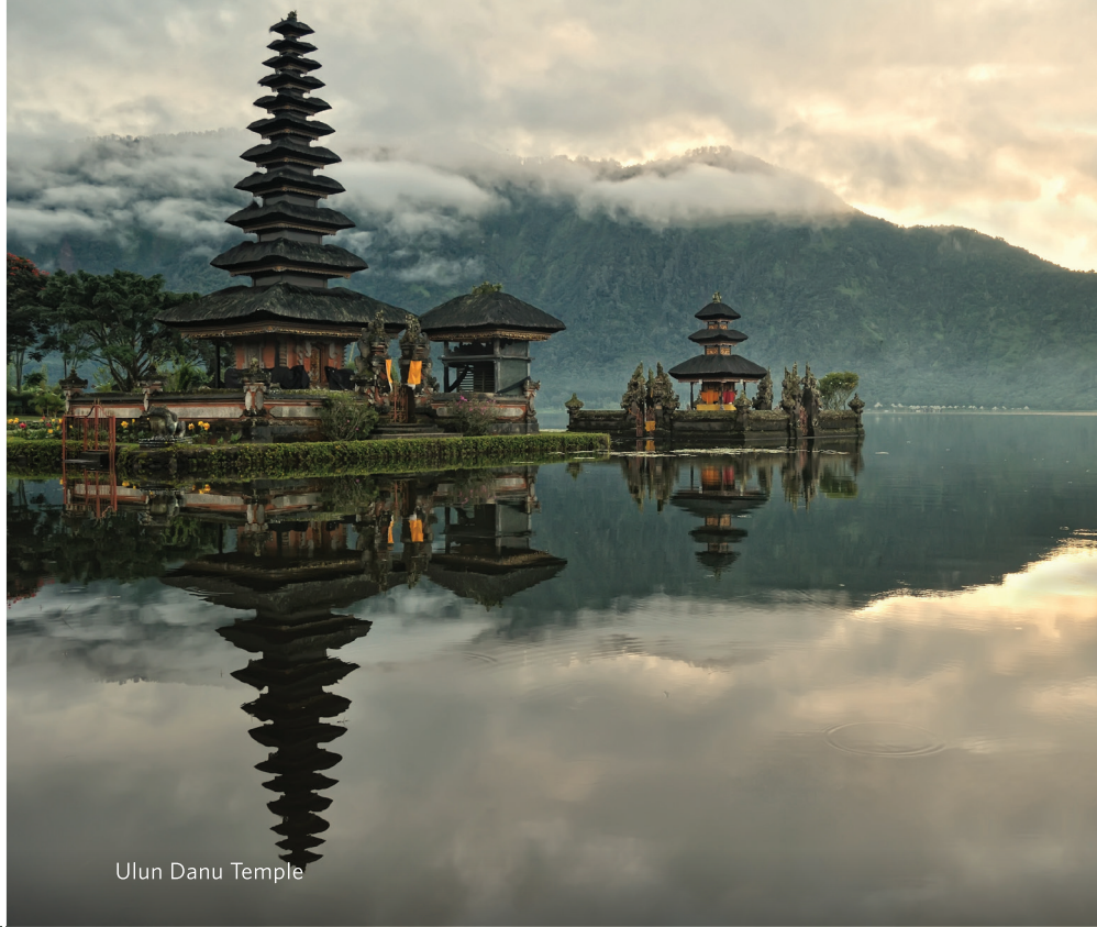
Ulun Danu Temple