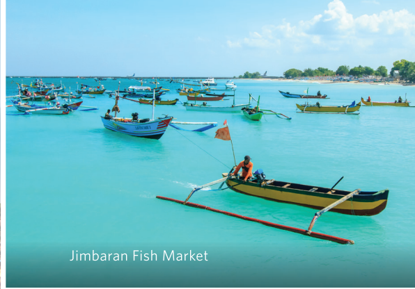
Jimbaran Fish Market