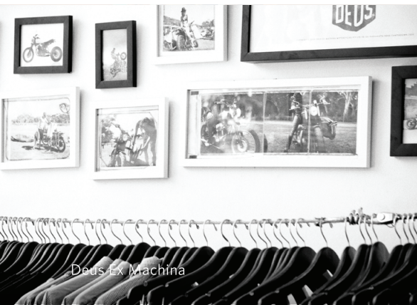
Deus Ex Machina