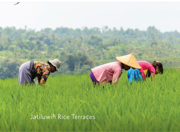
Jatiluwih Rice Terraces