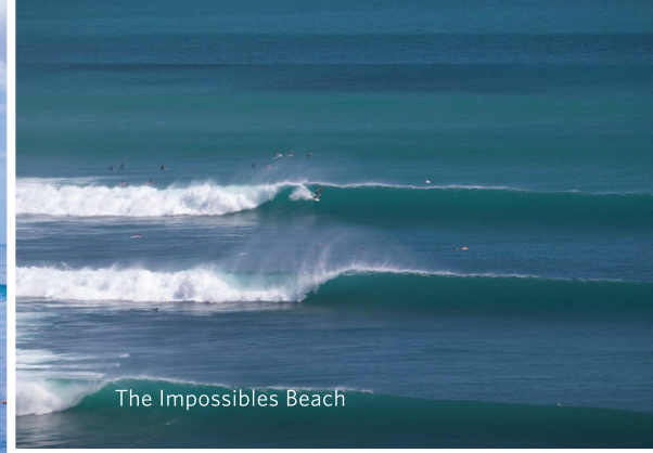
The Impossible Beach