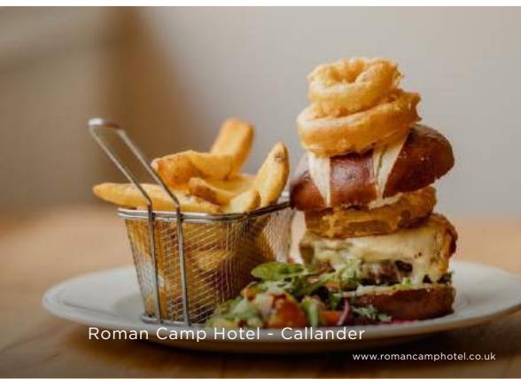
Roman Camp Hotel - Callander