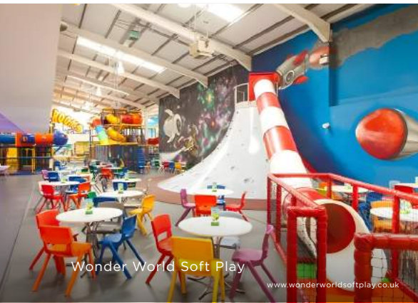
Wonder World Soft Play