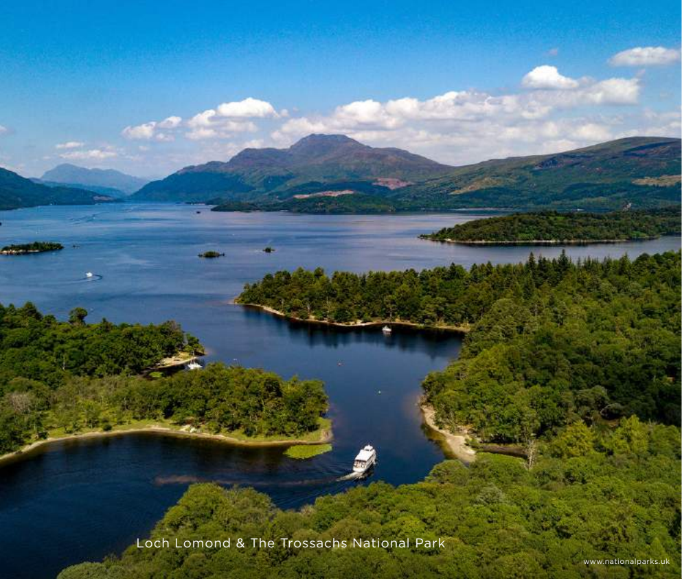
Loch Lomond & The Trossachs National Park