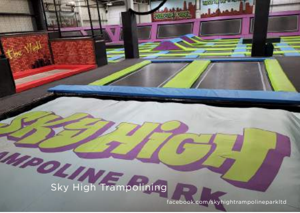
Sky High Trampolining