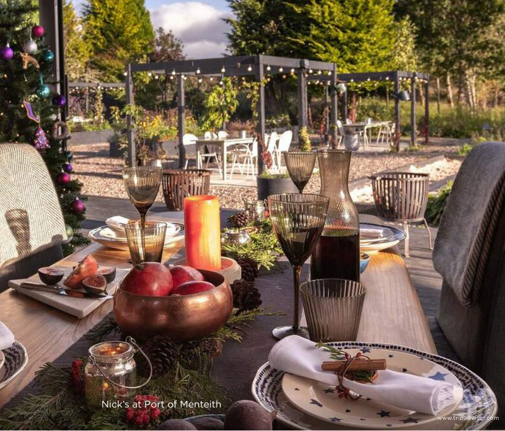
Nick's at Port of Menteith