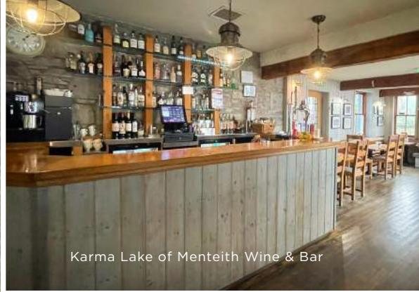
Karma Lake of Menteith Wine & Bar