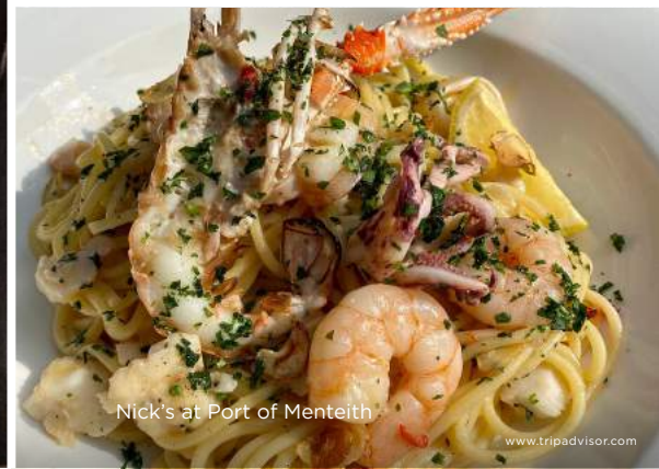
Nick's at Port of Menteith