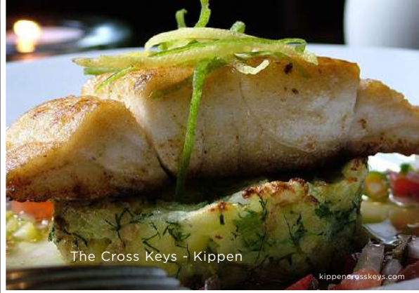
The Cross Keys - Kippen