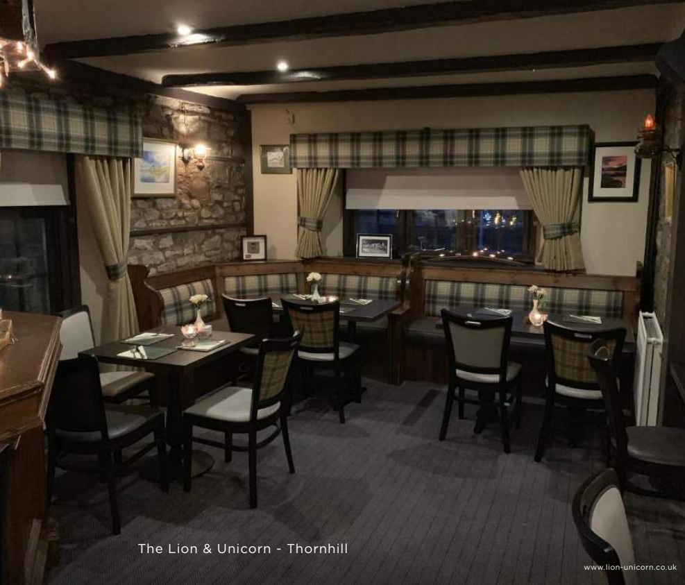
The Lion & Unicorn - Thornhill