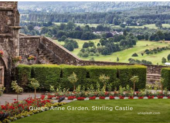
Queen Anne Garden, Stirling Castle