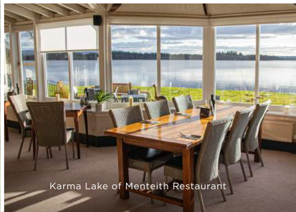
Karma Lake of Menteith Restaurant