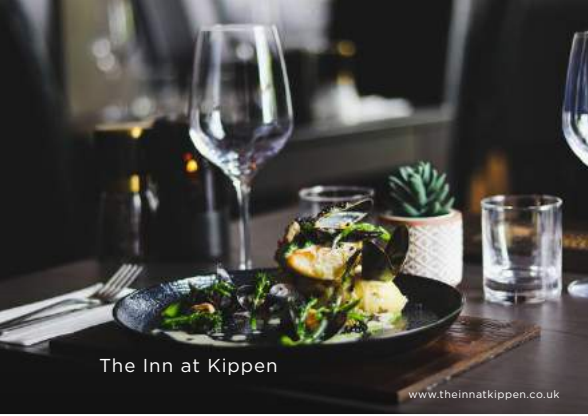
The Inn at Kippen