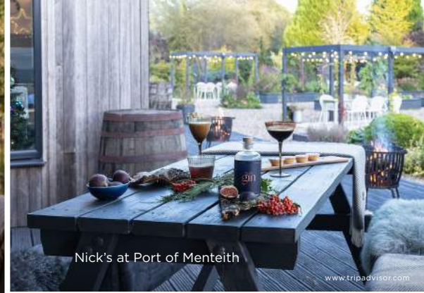
Nick's at Port of Menteith