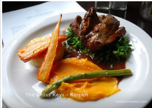
The Cross Keys - Kippen