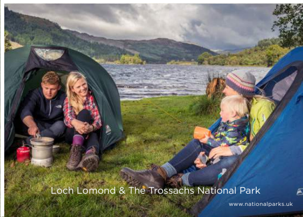
Loch Lomond & The Trossachs National Park