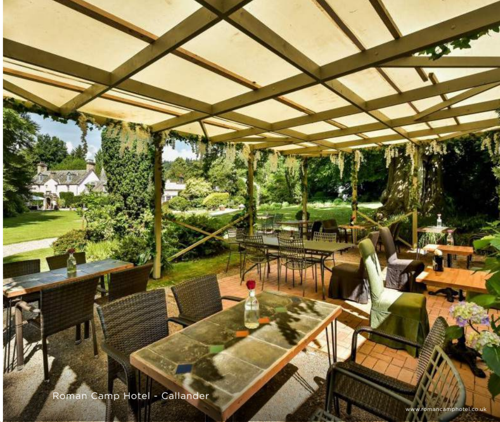
Roman Camp Hotel - Callander