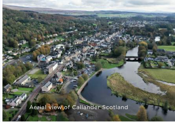
Aerial View of Callander Scotland