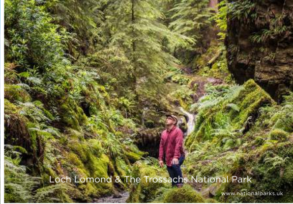
Loch Lomond & The Trossachs National Park