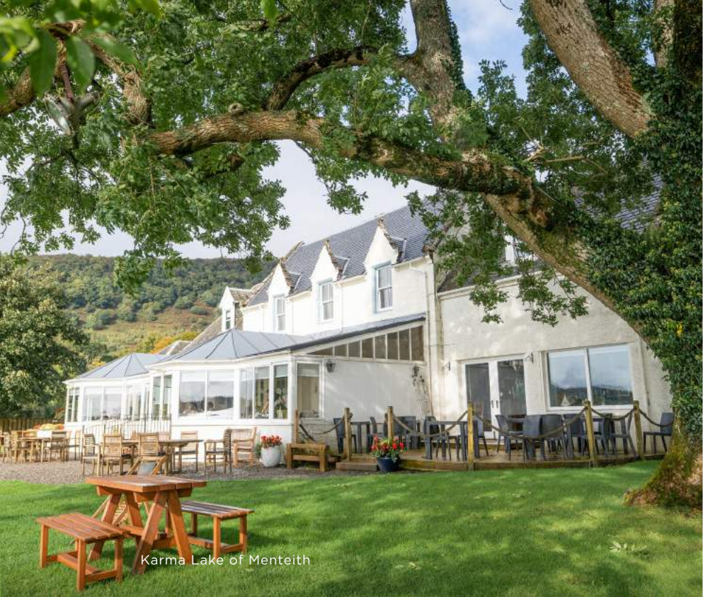
Karma Lake of Menteith