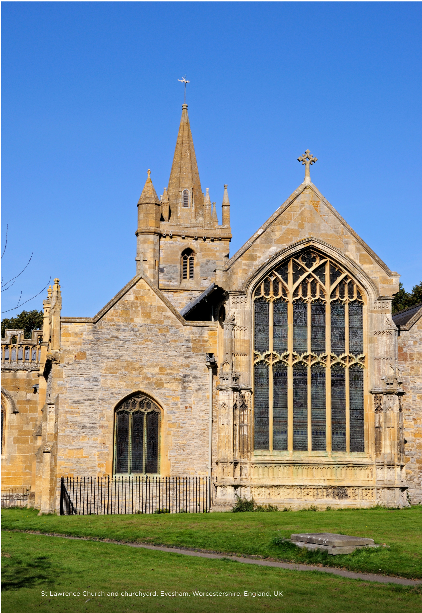
St Lawrence Church and churchyard, Evesham, Worcestershire, England, UK