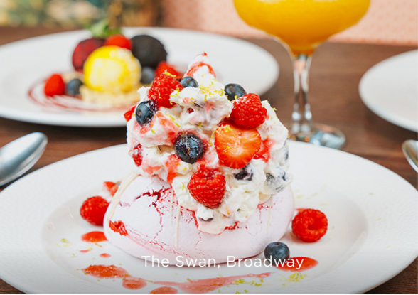
The Swan, Broadway