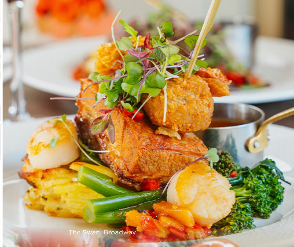
The Swan, Broadway