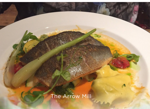
The Arrow Mill