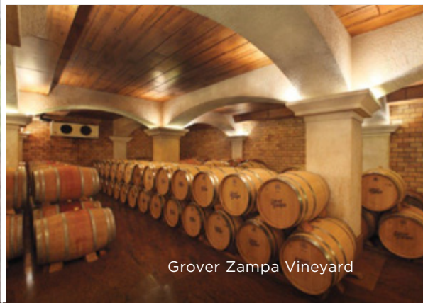
Grover Zampa Vineyard