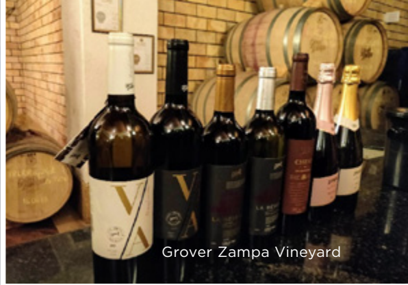
Grover Zampa Vineyard