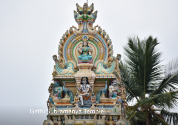
Ghati Subramanya Temple