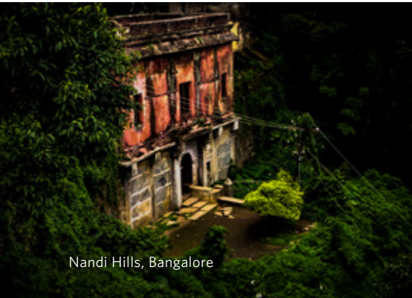
Nandi Hills, Bangalore