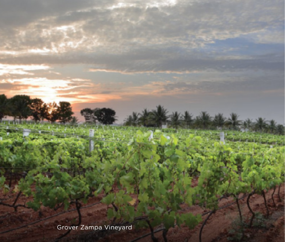
Grover Zampa Vineyard