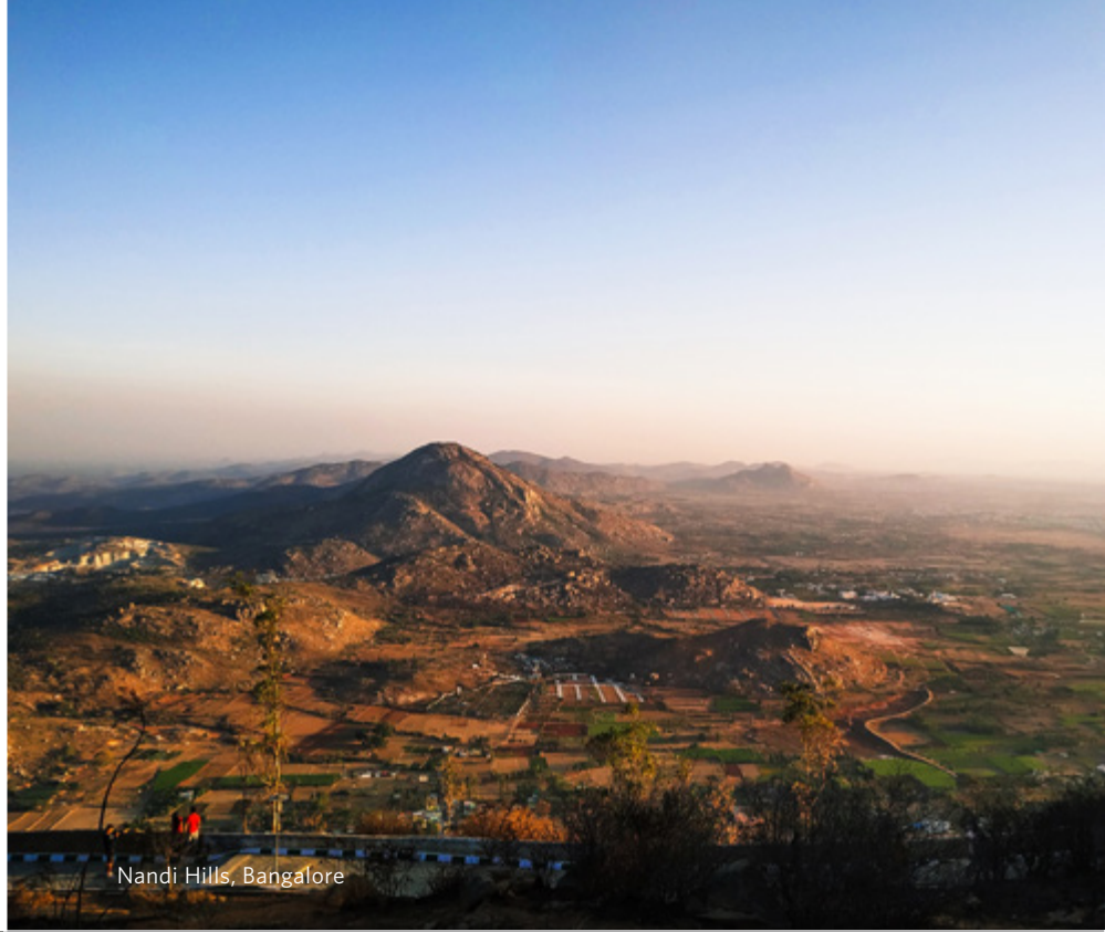
Nandi Hills, Bangalore