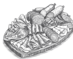
Italian Cured Meats to Share (B,P)