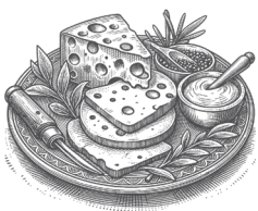
Imported Italian Cheeses to Share (V)